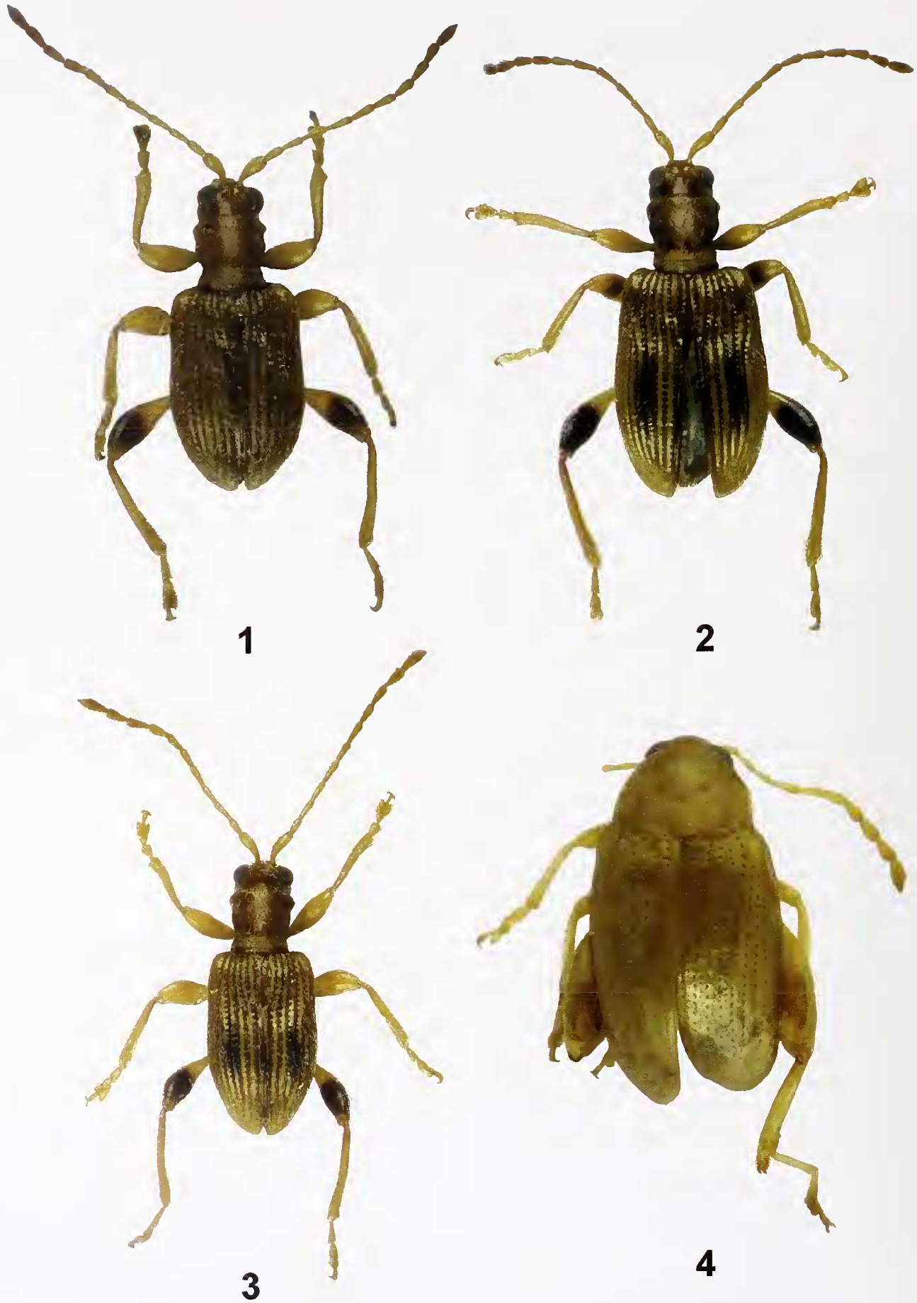
Figs 1–4. 1–3. Lipromorpha alutacea sp. n. 1. male, Hsitou; 2. female, Tengchih; 3. male, Tengchih. 4. Psylliodes palleola Motschulsky, lectotype.